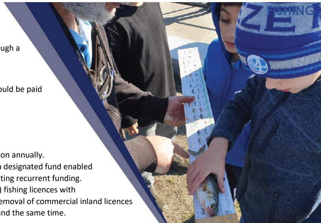
Photo: Fishcare Victoria – Creating Sustainable Anglers Project – Funded by RFL Large Grant

Over the years, the RFLTA has also funded government initiatives such as Target One Million, which includes stocking programs, access and facilities development of new fishing waters and more recently, sustainable habitat and revegetation projects.