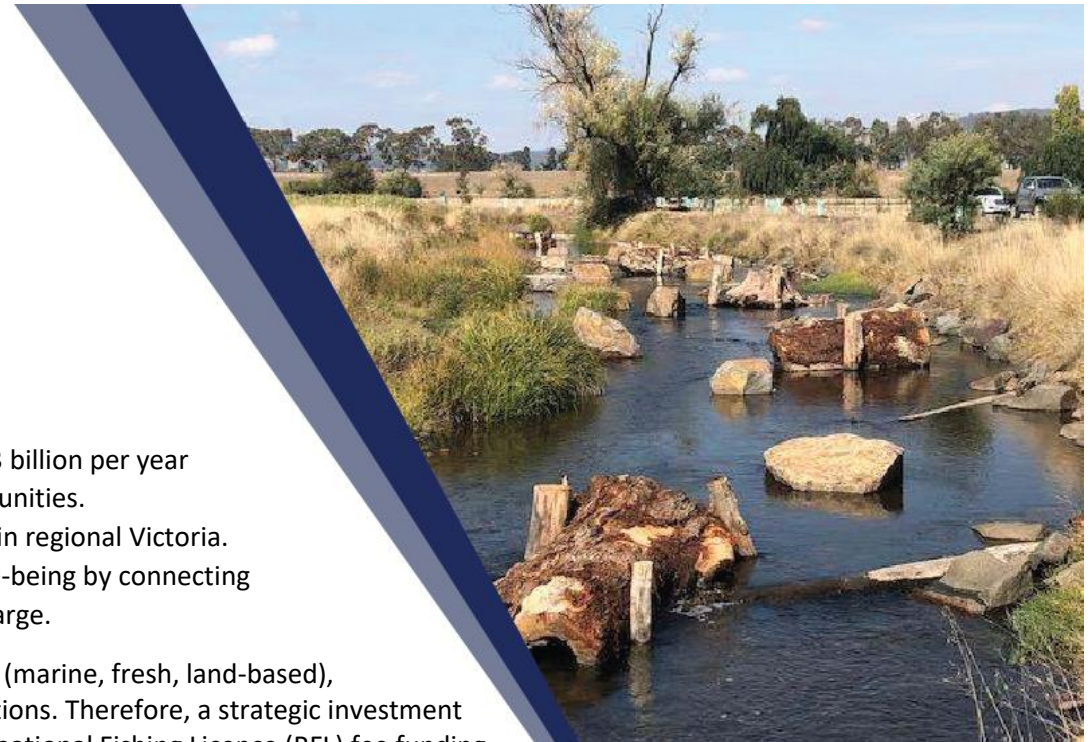
Photo: Delatite River Instream Restoration Project - ATF - Funded from Better Fishing Fund

For further information, please visit: https://vfa.vic.gov.au/recreational-fishing/fishing-licence/your-fishing-licence-fees-at-work