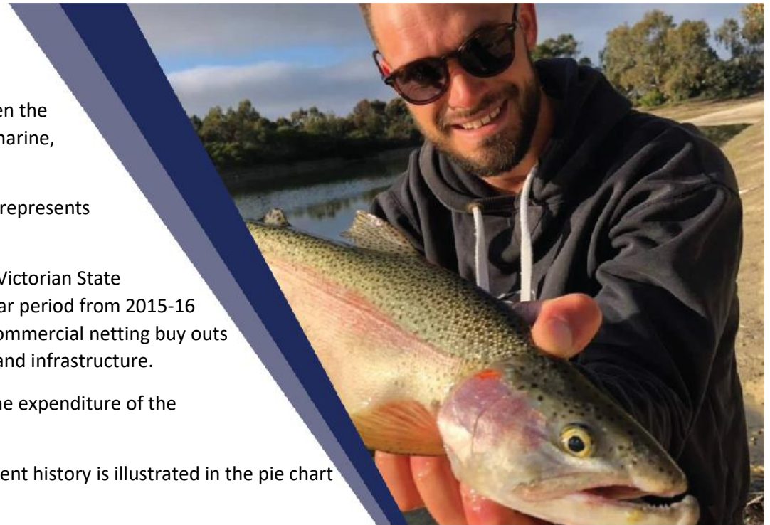
Photo: Fishcare Victoria – Responsible Anglers Academy – Funded by RFL Large Grant

The current priority investment areas and 3-year average of recent RFLTA investment history is illustrated in the pie chart below.